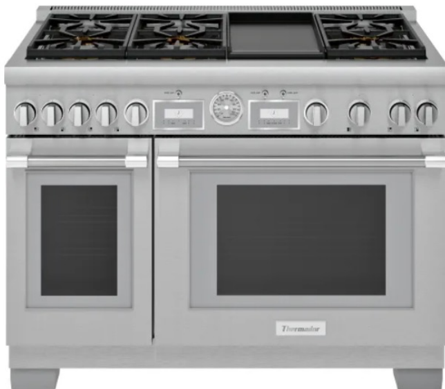
Thermador Range + Microwave