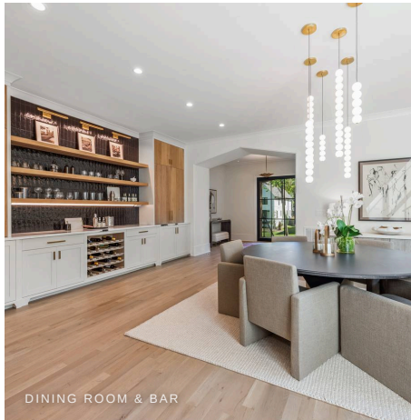
DINING ROOM & BAR