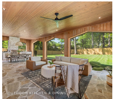
OUTDOOR KITCHEN & DINING