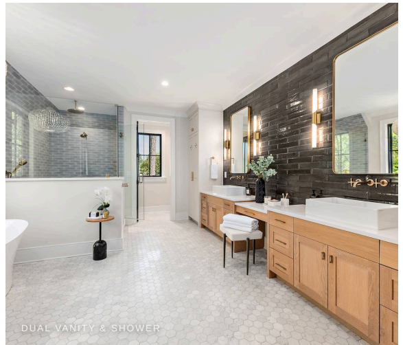
DUAL VANITY & SHOWER