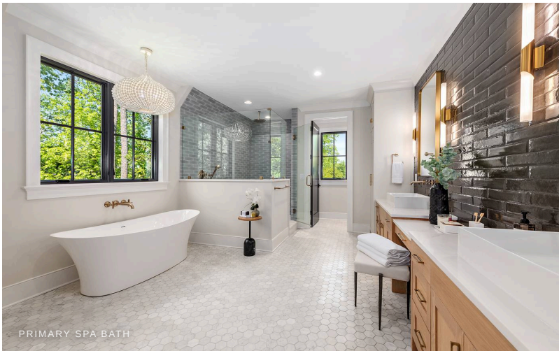
PRIMARY SPA BATH